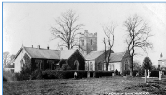
The school was situated in the churchyard southeast of the church. It was built about 1840