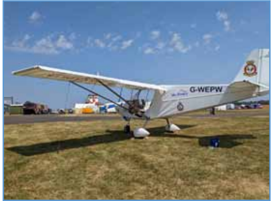
The aircraft, its registration as well as the RCAF 434 Sqn badge on the lower fuselage