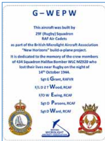
The plaque created and mounted inside the aircraft

it. One of the key points is that they have worked out that the five-letter UK civil aircraft registration could be made up by using the first letters of the crew that lost their lives. A most thoughtful gesture.