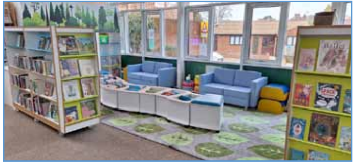
The newly refurbished children's area

the library for organising events like knit and natter, Lego club, health and wellbeing, baby and toddler group; if you have an idea and would like to organise a group then please apply to the Parish Clerk for advice. clerk@dunchurchpc.org