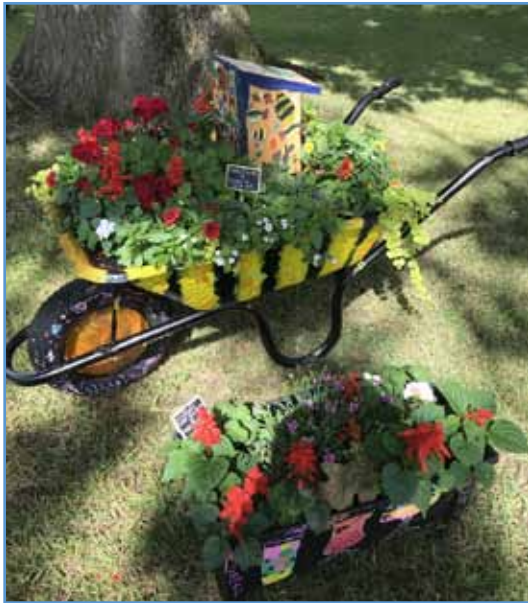
Wheelbarrows and troughs the girls planted last year

G irlguiding in Dunchurch is thriving with all three units meeting on a Wednesday – Rainbows at the Village Hall, Brownies at Dunchurch Baptist Church and Guides at Thurlaston Village Hall. All units take part in the Girlguiding Programme which was created by girls for girls so that they would have fun, adventure and variety. Girls are encouraged to take part in a variety of new things,