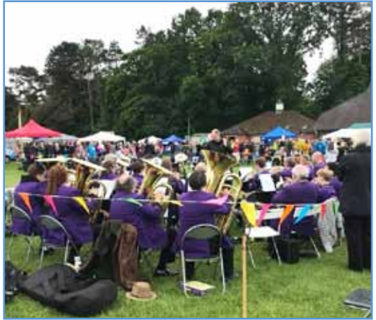
The band are regular attendees at the Dunchurch Village Fete

Dunchurch Band are excited to announce that we will be launching our new Training Band in September. There will be opportunities to be involved in some pre-launch events – more information to follow. However, in the meantime if you or someone you know would like to learn to play a brass instrument, we would love to hear from you. We can provide low cost tuition