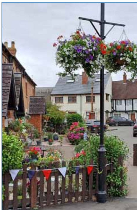
Lamppost hanging baskets funded by FODS