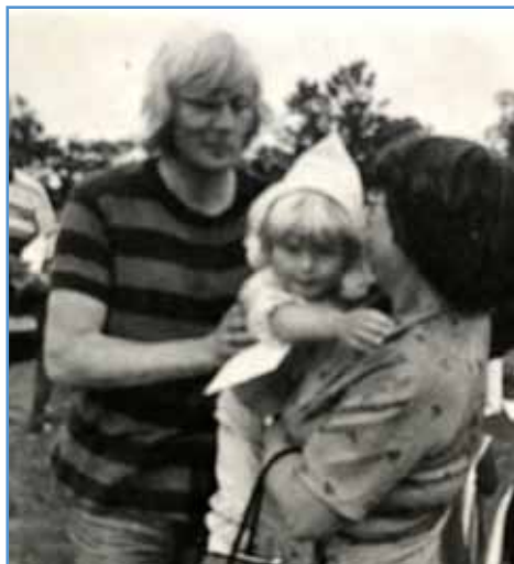
Chris Tarrant with one of the 1977 Dunchurch Fete prize winners. Do you recognise yourself as the baby in the photo?

One of the advantages of having a village magazine is that it serves as a documentation of these events and other aspects of our present-day life and as a reference as recollections may fade. Take for example, a Dunchurch article that appeared in a 1977 publication of Warwickshire and Worcestershire Life informing 'community