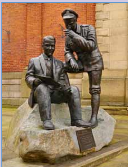
Our mystery man and a World War I soldier in Trinity Street, Stalybridge